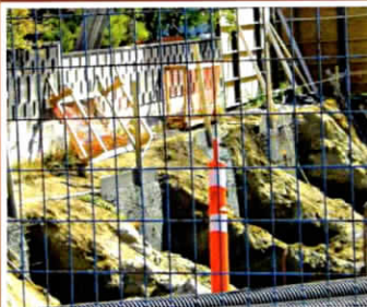
▲ Excavation for Shoring