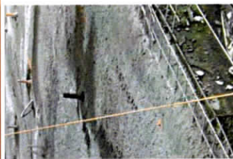
▲ Wire Mesh and Shotcrete