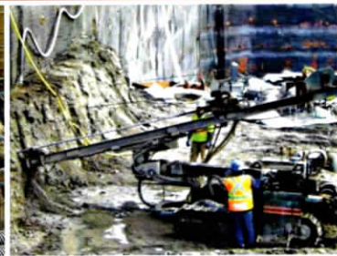
▲ Shoring Rod Drill